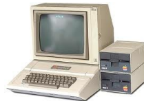
1977 - Apple II