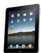
2010 - iPad