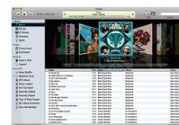
2003 - iTunes