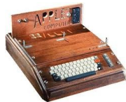
1976 - Apple I

Who can say he or she never used one of those?