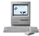
1984 - Macintosh