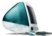
1998 - iMac